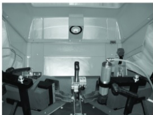
CM 50 MODEL