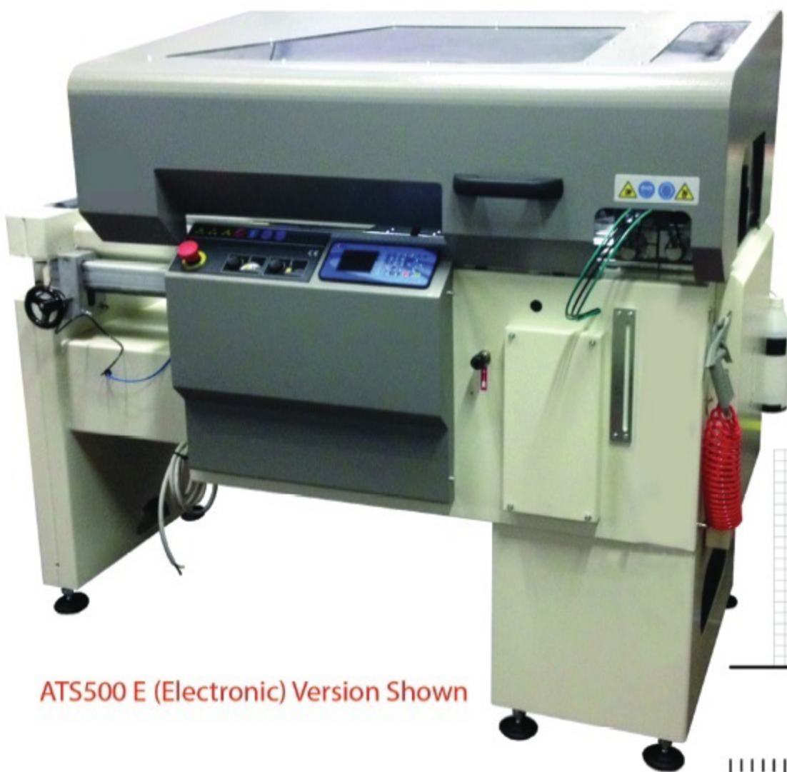
ATS500 E (Electronic) Version Shown

The ATS500 Automatic cut off saw is designed for repetitive cutting without operator intervention. Full lengths of extrusions can be loaded and cut utilizing an automatic rising blade and adjustable profile movement from 0 to 600 mm (0 to 24 in). Fully automatic cutting operations, total cutting area protection with a generous cutting envelope and the utmost accuracy and reliability rounds off this saws capabilities.